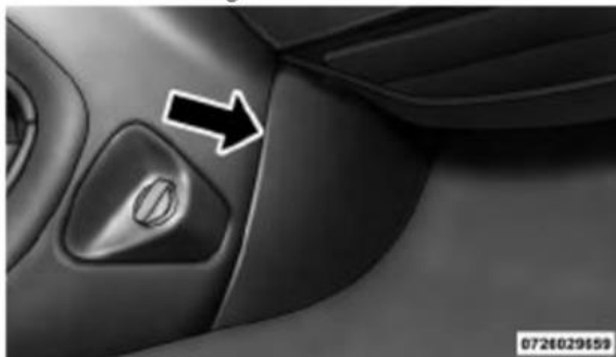
Console Closeout Panel Figure 1