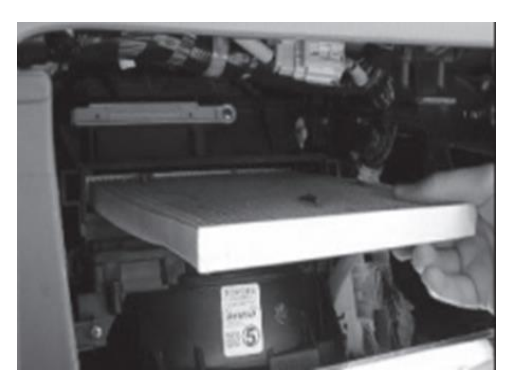
Figure 3 Figure 4